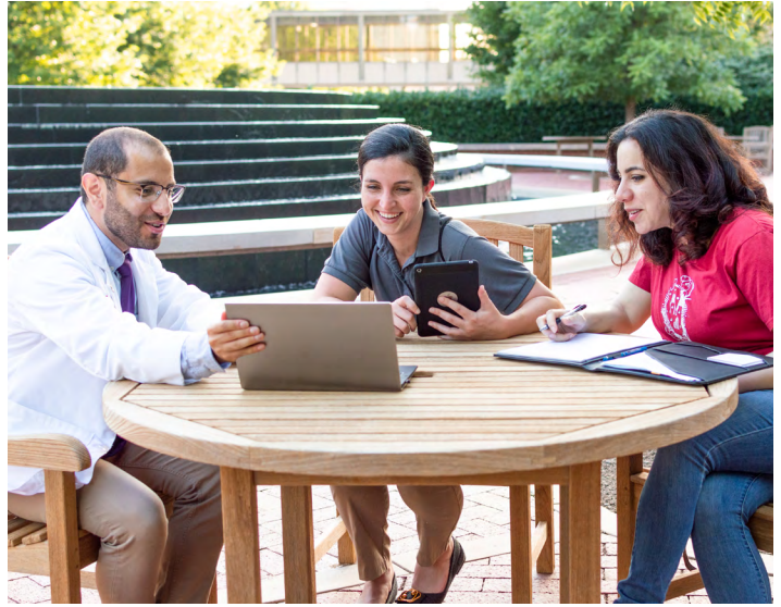
*Photo taken prior to the COVID-19 pandemic and does not reflect current masking and social distancing requirements.

Online Sexual Misconduct Awareness Training: This is a mandatory sexual misconduct awareness training program for all incoming students. Additionally, all faculty and staff are required to take a similar web-based training. It is an interactive web-based training and quiz, discussing the university's gender discrimination, sexual harassment, sexual misconduct policy and gender-based issues. Refer to learn.ouhsc.edu for the quiz and ou.edu/eoo for the policies.